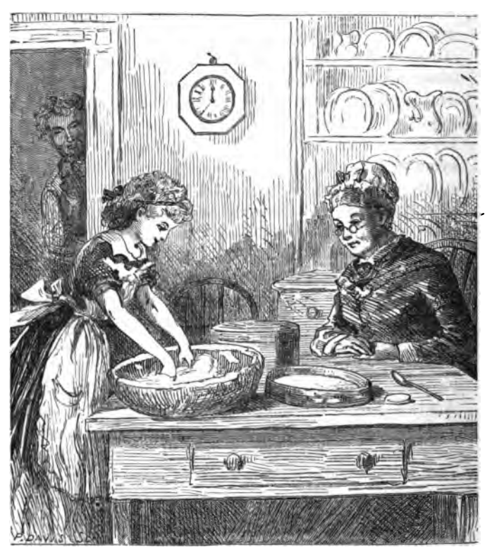
out troubling any one, when Rose's new whim suggested an excellent method of weaning her a little from himself. He did not know how fond he was

Dr. Alec had found out this little secret, and, after reproaching himself for being blind and selfish, was trying to devise some way of mending matters with-